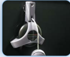
a. Suction cup

There are 2 ways to place the SpyderTV PRO colorimeter on your screen: